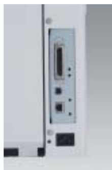
Standard TCP/IP support