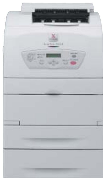
DP C525 A fully configured

The DocuPrint C525 A offers outstanding value for customers who require fast black and white printing and high quality colour printing at a small price.