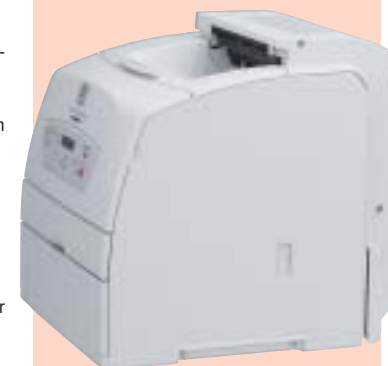
DP C525 A with duplex unit