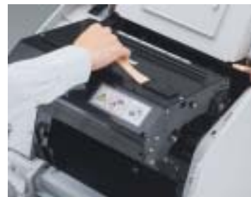
Easy drum replacement